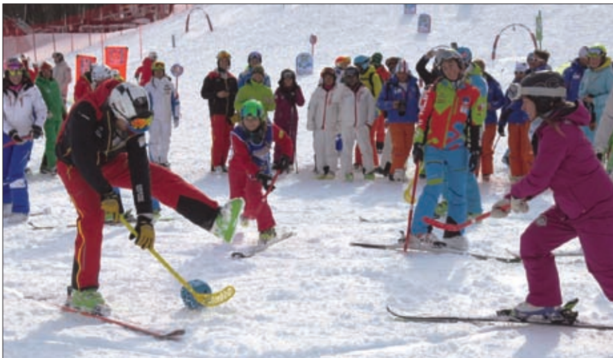
Kids On-Snow Presentation by Italy.

In 2019 the next Interski will be hosted by the famous Pamporovo winter resort in Bulgaria. To attend as a delegate stay tuned to: http://www.interski.org/index.php/en/home-en .