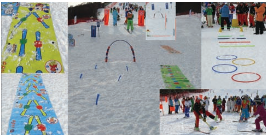
Interski 2015, Learning through Play Presentation, Italy.