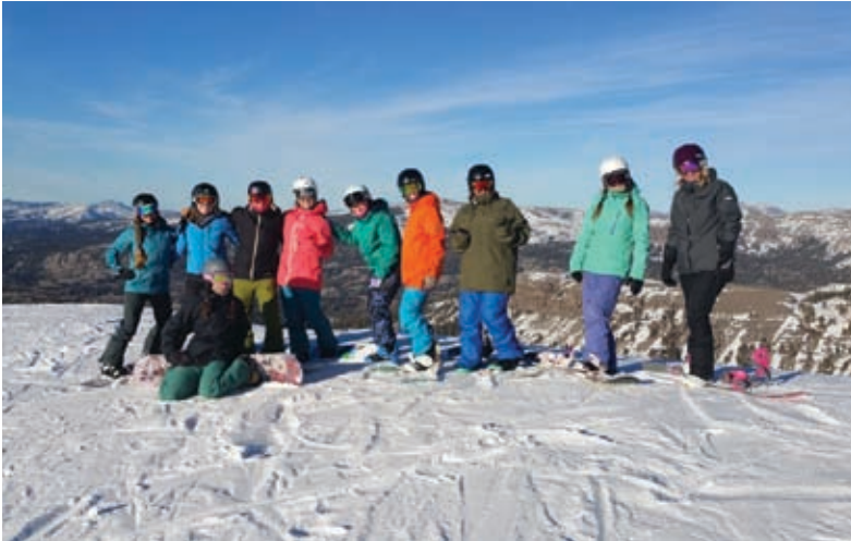
Women's Freeride Camp, 2014.

should attend a Resort Trainer Course early season and then sign up with the Snowboard Discipline Chair via email by February 1st to get into the program.